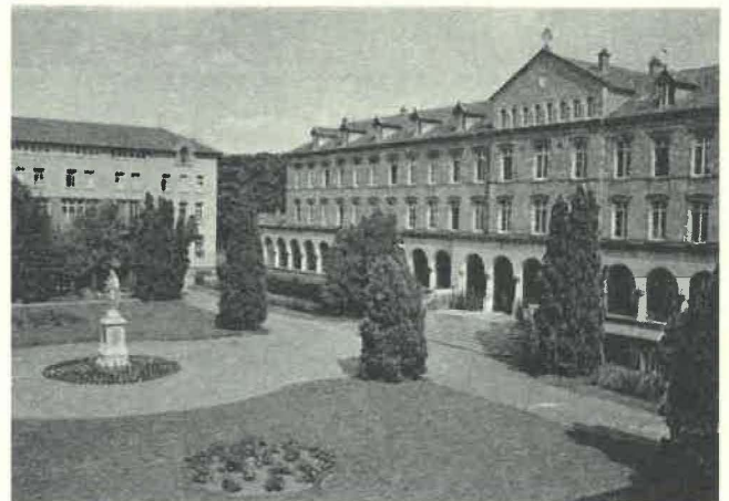
Chevilly, Chapter wing.

10 work (or have worked) in Brazil, 7 in Nigeria, 4 in the Congo, 4 in Kenya, 4 in Senegal, 3 in Cameroon, 3 in Tanzania, 2 each in Angola, the Central African Republic, Madagascar, Mauritius, Peru, Puerto Rico, Sierra Leone and Zaïre, and one each in South Africa, Cape Verde, Gabon, Gambia, Ghana, Guadeloupe, Guinea, French Guiana, Haiti, Martinique, Mexico, Reunion and Trinidad.