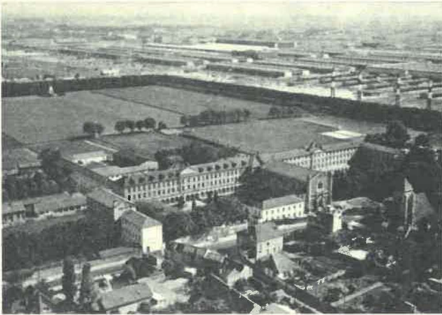
Chevilly, aerial view.