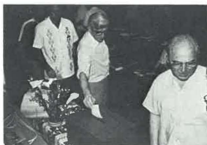
During the election ...