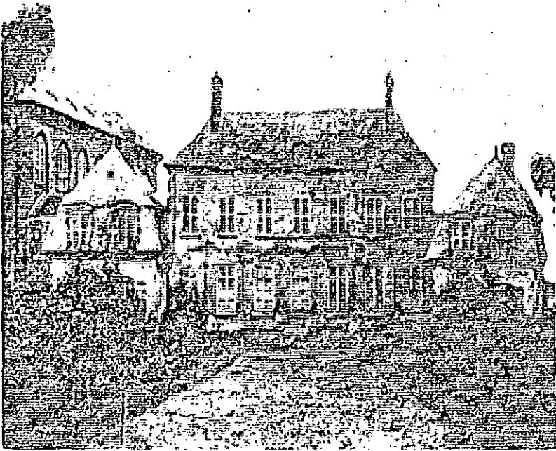
Photo of La Neuville, the cradle of the Congregation of the Holy Heart of Mary. It served as the novitiate and house of studies between 1841 and 1847