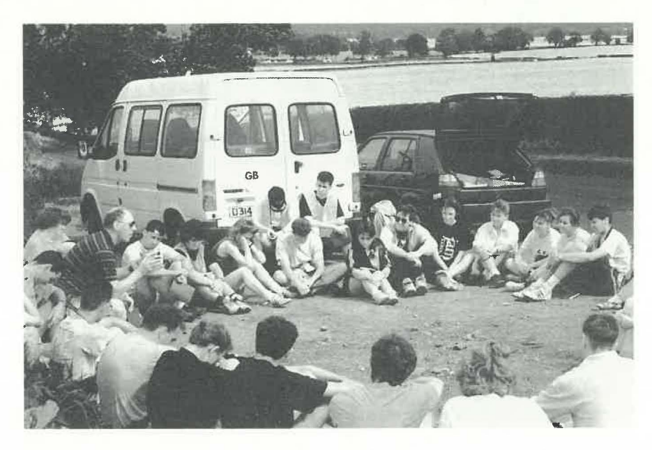
A European Pilgrimage-Walk

Well aware that youth have moved from a "culture of obedience" to a "culture of experience", we try to help them experience the meaning of faith-in-action by personally involving them in a whole series of events and activities that continue throughout the year: "100 mile walks", residential retreats, workshops, Taizé events, Lourdes Pilgrimages, talks, Pentecost Youth weekends and fortnightly Youth Group Meetings. Our aim is to build up their faith, helping young people to become leaders themselves