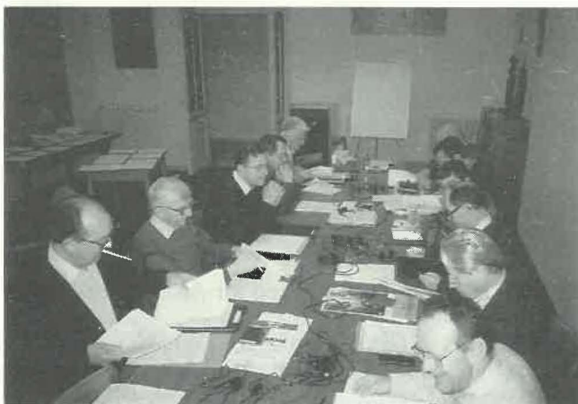
The Provincials at the Generalate

This took place at the Generalate November 22 - 27. Taking part for the first time were the recently appointed Provincials of Germany, Poland, Spain and Switzerland. Work sessions were based on reports from meetings of those responsible in each Province for the various sectors: training, the Spiritan Month, Spiritan magazines and publications, bursars, and the co-ordinators of J&P and those who work on vocations and animation. Certain orientations have been taken and decisions made. Spiritans doing studies at 3rd level or studying languages (particularly those from "the South") are welcomed. At Easter 96, there is to be a meeting of those in training. A pilgrimage on foot from Rome to Loreto is planned "in Libermann's tracks" for candidates to our Congregation in September 94. Meetings - for Spiritans who work in our schools, around Easter 94, for those working in the media and audio-visual, in May 95. The next Spiritan Month, "new formula" (three weeks, second week a Spiritan Retreat) is at Gentinnes in August 95. The meeting reaffirmed commitment to the undertaking in Rostock, in former East Germany. Two German and two Irish Province confreres are already appointed. Choosing the Generalate for their meeting gave the Provincials plenty of opportunity to consult and exchange ideas with the General Council. The next meeting is to be in Poland in November 1994.