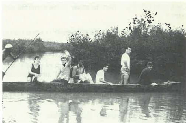
"Jovens sem Fronteiras" in Guinea-Bissau.

These young people commit themselves to missionary animation within their communities by showing solidarity and openness to the values of other cultures and sharing on a basis of respect and equality. Each summer some of these young people go to a missionary country.