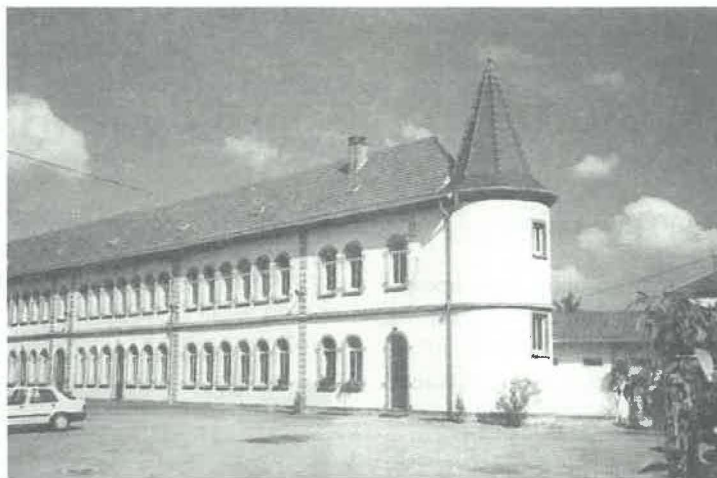
The Libermann Centre, Saverne

The Centre has begun an outreach programme. Team members have been invited to preach retreats and recollections in places not related to the Centre. These retreats are not limited to communities of Religious. One member of the team gives a talk on the Holy Spirit every Wednesday during Lent in the parish of Saverne".