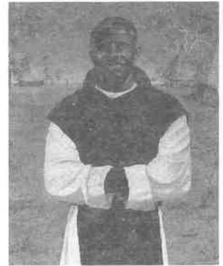
Blessed Fr Tansi