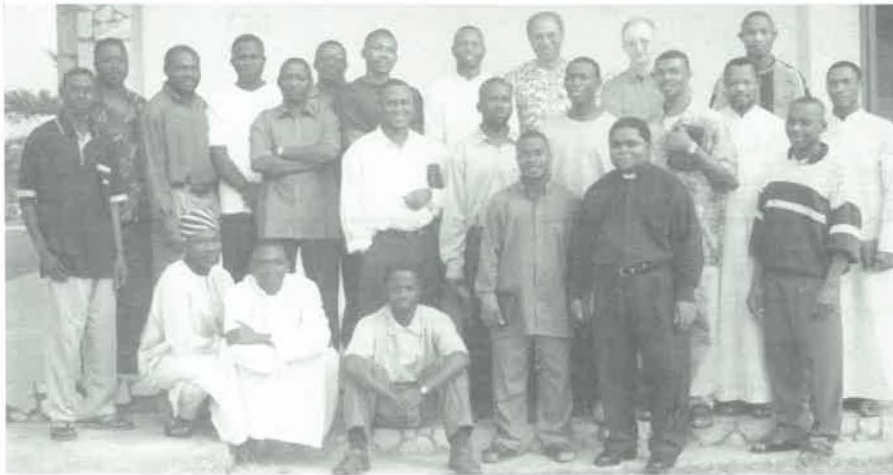
Two General Councillors and some WAF-Makurdi confreres present at Ejisu meeting 27-28 Dec. 1999

The new Province of Nigeria will come into existence on 2 nd October 2001 , the date on which we commemorate the death of our founder Claude-François Poullart des Places. It will be made up of 4 Regions , divided on the basis of the existing dioceses in the country.