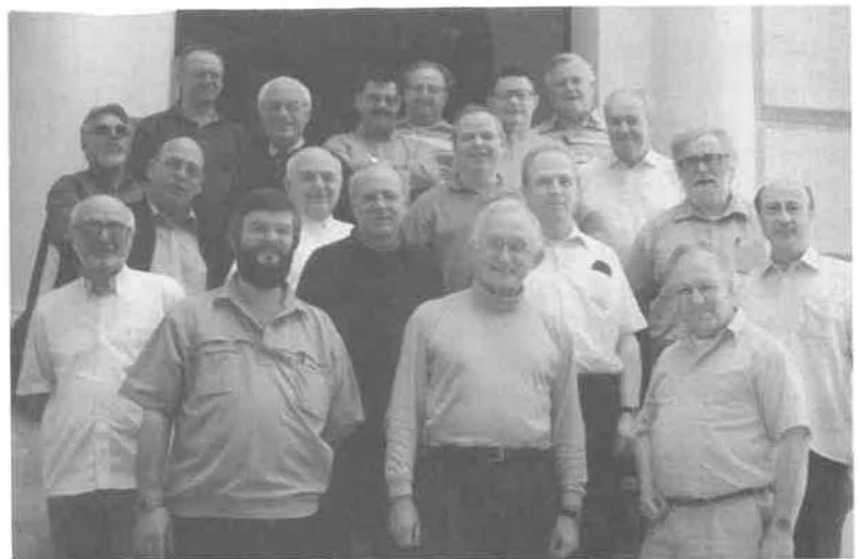
Spiritans Bursars and procurators of Europe

The bursars and Procurators took a day off to visit Subiaco, the place where St Benedict lived, the Patron of