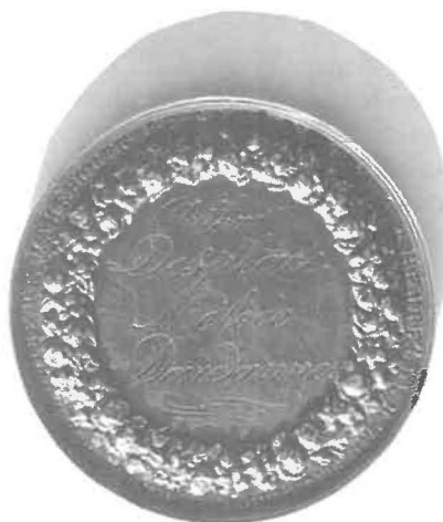
Souvenir medal (Reverse side)