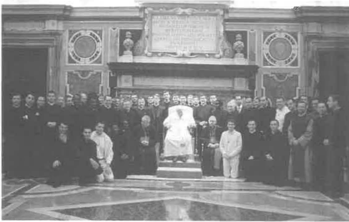
Audience with the Pope on 1 st December 2003